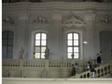
On the left, one can see one of the blind windows next to the windows facing towards the interior courtyard.

We will gladly give you more information on enquiry ."