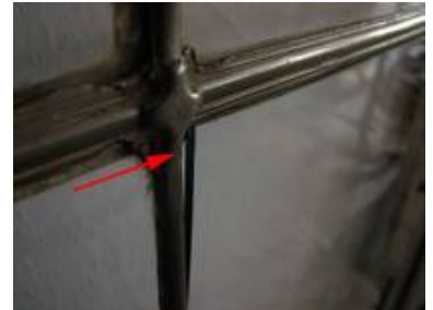
Here, it is plain to see the load which the normal float-glass panes impose upon the original lead netting.