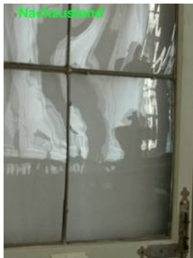
In the condition after the completion of work, this supplementation adapts ideally to the historic inventory.