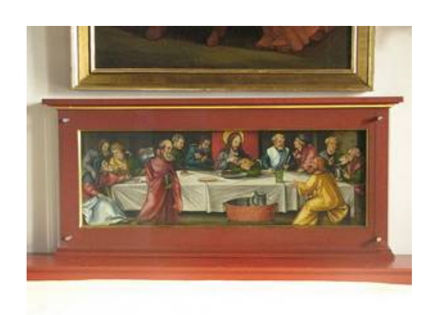
The image tableau by Hans Schäufelin (Schäufelein) in detail, with the already-assembled UV protection pane.

Of course, this glass can also be used in a display case or a picture frame.