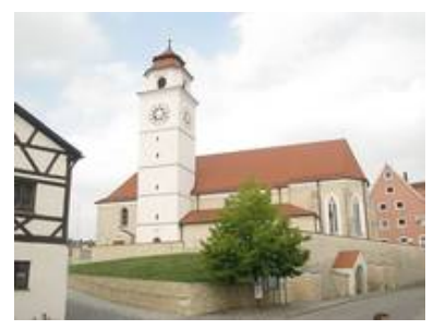
The parish church St. Peter and Paul in Dollnstein

Despite this particularly high level of UV protection, the painting can be viewed in a manner which rules out misrepresentation – since due to the exact position of the filter edge, the colour reproduction is natural.