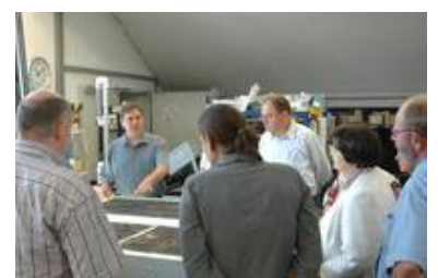
Also in the course of this planned