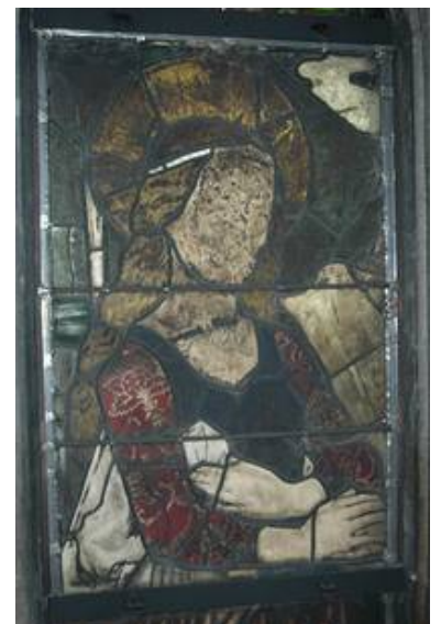
The glass-painting field NII 7b from the medieval inventories, in its previous condition - in situ