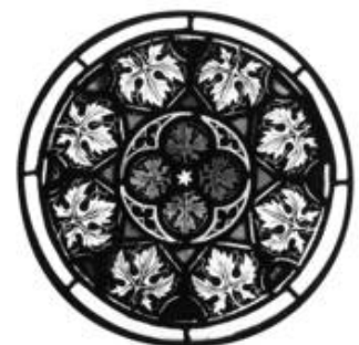
48. Rosette mit Weidenh. Frankfurt, Historisches Museum Nr. 13, > Kat. S. 106

Rosette with grapevine. Frankfurt a.M., Historisches Museum. Ehem. Frankfurt, Dom. Illustration from