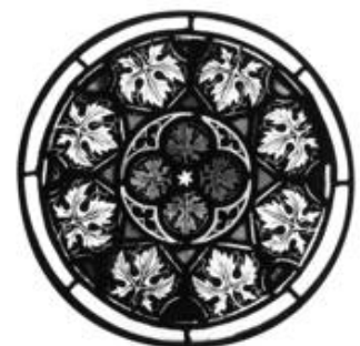
48. Rosette mit Weidenkranz, Frankfurt, Historisches Museum Nr. 13, > Kat. S. 106

Rosette with grapevine. Frankfurt a.M., Historisches Museum. Ehem. Frankfurt, Dom. Illustration from