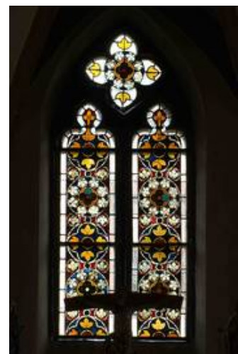
The interior of the church with the choir-loft-crown window