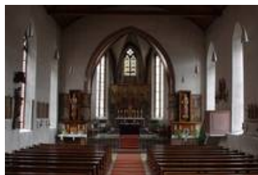
The interior of the church with the window at the crown of the choir loft

The panes are exquisitely preserved. One can document just a very few supplements (some of which also originated in the Middle Ages). The panes have also kept their original, medieval lead netting, which is very rare.