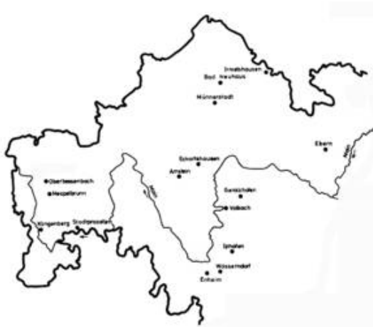
Overview of the medieval glass paintings in Lower Franconia (in situ)