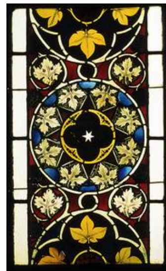
The field 6a from the window in Stadtprozelten shows the relationship between the studio(s).