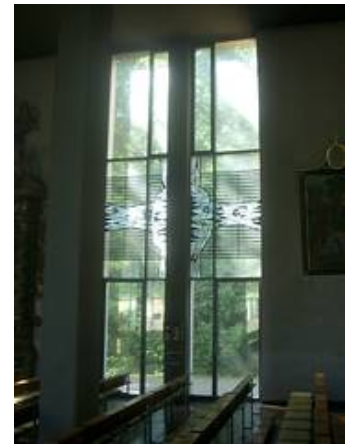
A window element in its previous condition