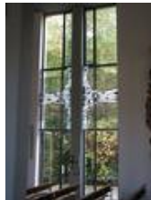
A window in the condition after work was performed