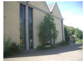
A front detail of the church in its previous condition