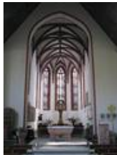
Condition of the interior after work was performed