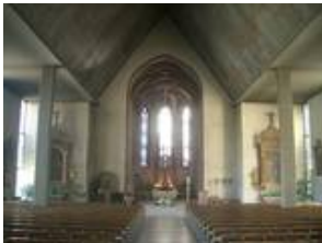
Previous condition of the interior before work was performed 2007/2008