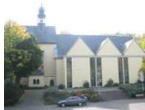
Exterior view in the condition after work was performed