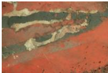
Detail of the same spot after cleaning, in the condition after completion of work.