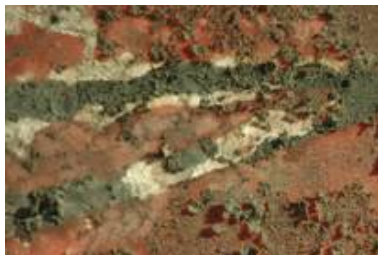
Detail of a medieval glass painting in its previous condition.

The first careful sample cleaning of a fragile surface.