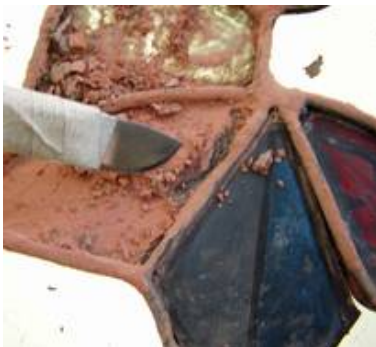
Painstaking exposure of a medieval leaded glass which was covered with wall paint.