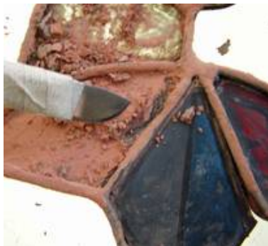
Painstaking exposure of a medieval leaded glass which was covered with wall paint.