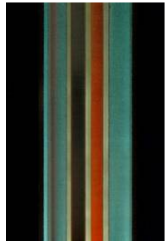
an edge in the transmitted light