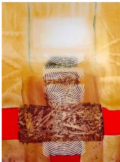
converted plate "light altar" © Joergen Habedank 2011 - www.farbige-kunst.de