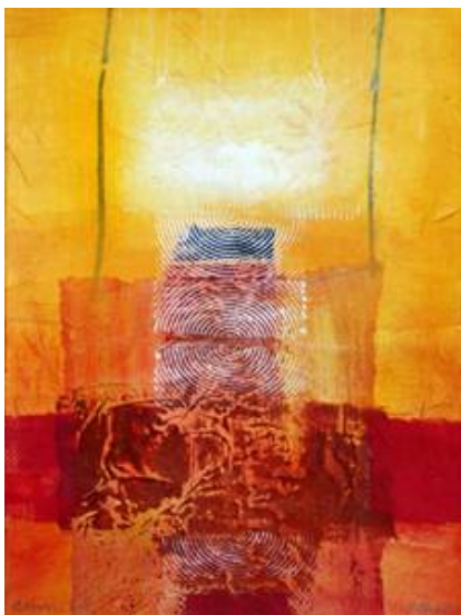
design "light altar" © Joergen Habedank 2011 - www.farbige-kunst.de