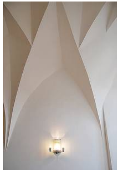
With additional high-energy lamps advanced wall light WM 03/W 1T-2 g in the priory to Meissen