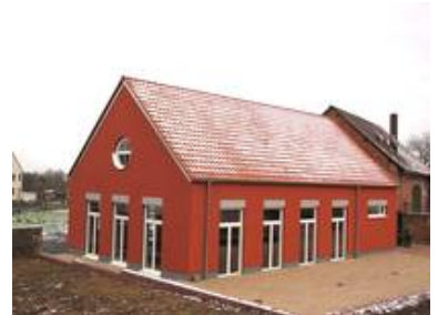
Würzburg manufactory light fixtures WM 09/P 1 T and WM 94/W 3-2 T in the vestry in Wenigumstadt

You will find further information on practical lighting in the following sections: Energy-efficient lighting and Light planning "