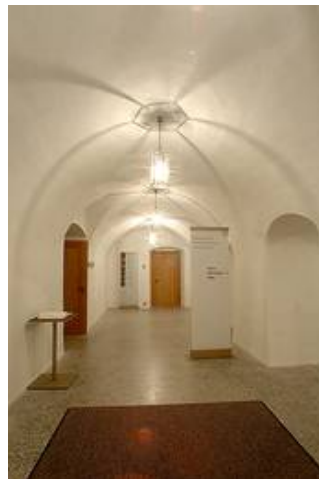
WB 79P 11 in the Liechtenstein National Museum in Vaduz