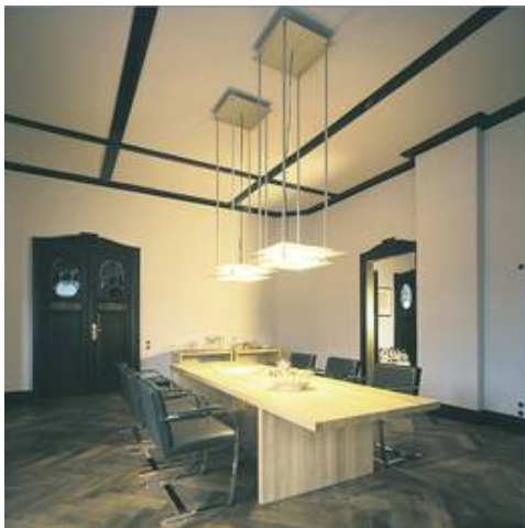
WM 02/DP 6-4 H in a conference room