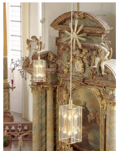
Würzburg lead lights WB 07 /P 2-9 here in brass in the cath. Church Weilbach