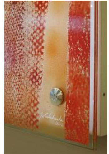
The signature of Joergen Habedank on the finished glass design. The static and the mounting conditions of just under 100kg panels were previously determined by a structural engineering office.