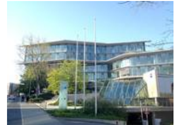
The CCI in Kiel is a felicitous representative and modern building