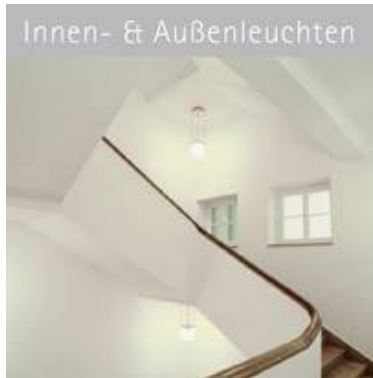
Innen- & Außenleuchten