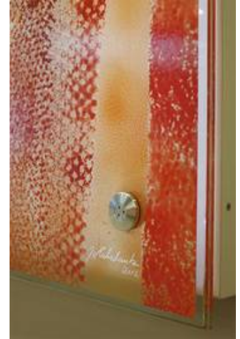
The signature of Joergen Habedank on the finished glass design. The static and the mounting conditions of just under 100kg panels were previously determined by a structural engineering office.