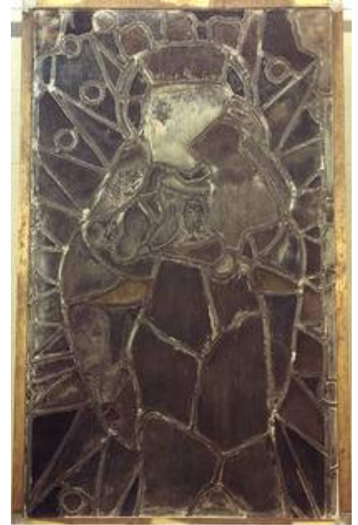
The exterior side of the medieval portrayal of the sun-crowned Madonna in reflected light displays the corrosion products typical to medieval panes.

We will gladly provide further information upon request.