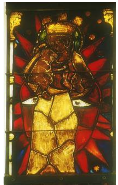
The interior in the transmitted light of the glass paintings makes the darkening due to browning recognisable.