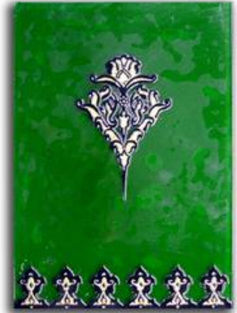
Glass tile with gold-leaf smelt and classic Arab ornaments