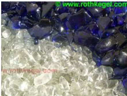
Fused glass pebbles in detail