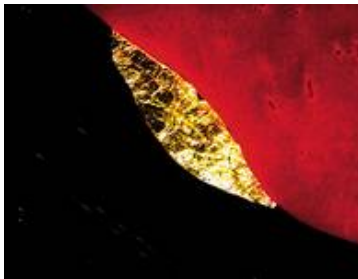
Detailed image of a gold-leaf smelt