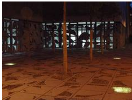
Fused glass gravel, backlit in an outdoor application