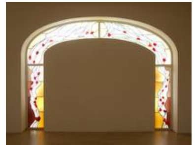
An unusual window shape, designed in classic leaded glass in modern arrangement, according to designs by Sabine Wiedemann