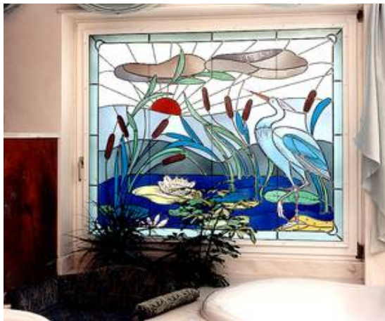
Another example of a different kind of blind in a bathroom – here, as leaded glass with glass painting, design and glass painting by Curd Lessig