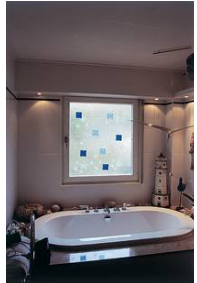
Instead of common ornamental glass, this bathroom window features an installed melted-glass pane (Fusing pane) with shaped mussels and sea stars.

Let yourself be inspired to also design your windows!