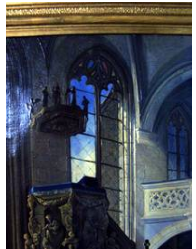
This painting clearly documented the original glazing.

The damage to the Castle Chapel caused by stones was significant; readily recognisable is also the arrangement of the lead fields and the original positions of the glass painting panes.