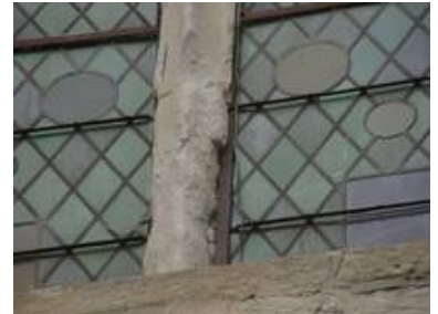
The damage to the Castle Chapel caused by stones was significant; readily recognisable is also the arrangement of the lead fields and the original positions of the glass painting panes.