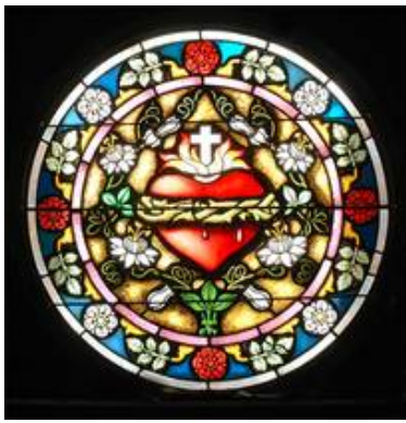
NIII 3 AB in the condition after completion of work