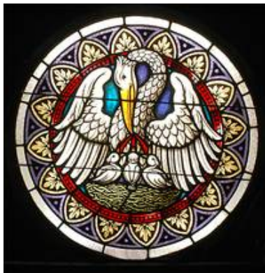
NII 3 AB in the condition after completion of work