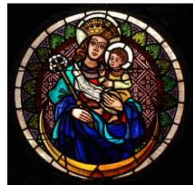
OI 3 AB in the condition after completion of work