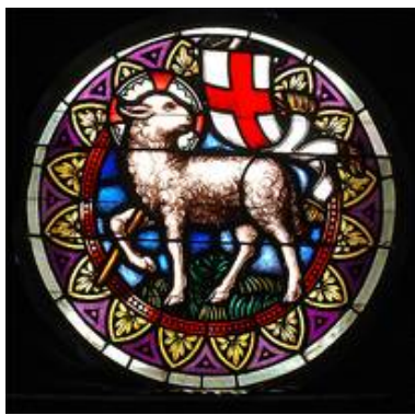
SII 3 AB in the condition after completion of work