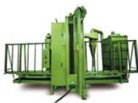
Why invest in a new sand-blasting installation; work as an artist with us.