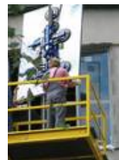
Also in the course of the installation of the object, we will assist you as an artist with our founded advice